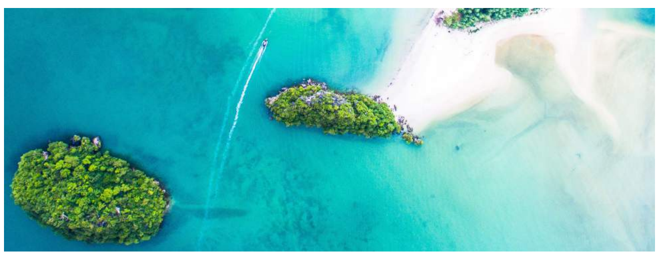
DAY 6 - 7: KOH LIPE

This southerly sail will take about 5 hours, and it's a wonderful chance to relax and enjoy the pristine scenery from up on deck. Koh Lipe is a small island on the verge of the Tarutao National Park, which consists of 51 islands and small islets and was originally home to a Malaysian Sea Gypsy settlement. Wild boars, civet cats, hornbills, monitor lizards, python and cobra are commonly spotted in the park at dusk, while the park's crystal clear water and coral rimmed beaches offer excellent snorkelling.